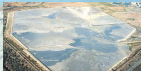
multi compartment tailings disposal