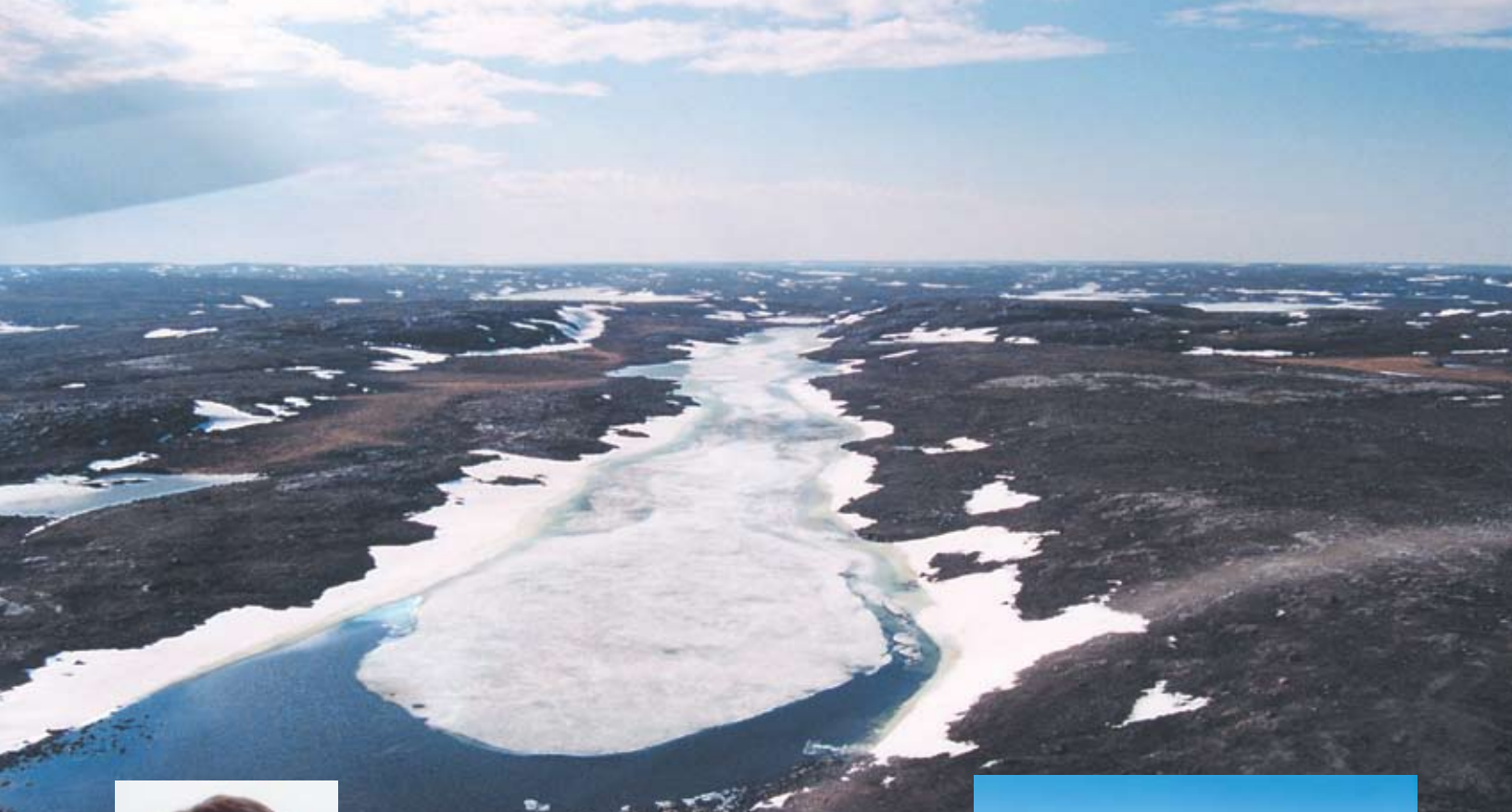
The lake proposed for use as the PKCA