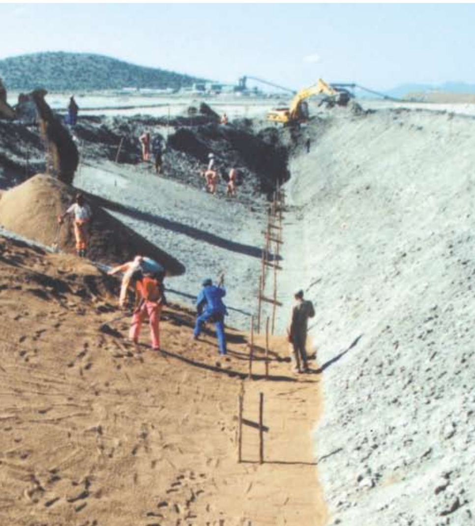
Continuous drainage installation as part of operation