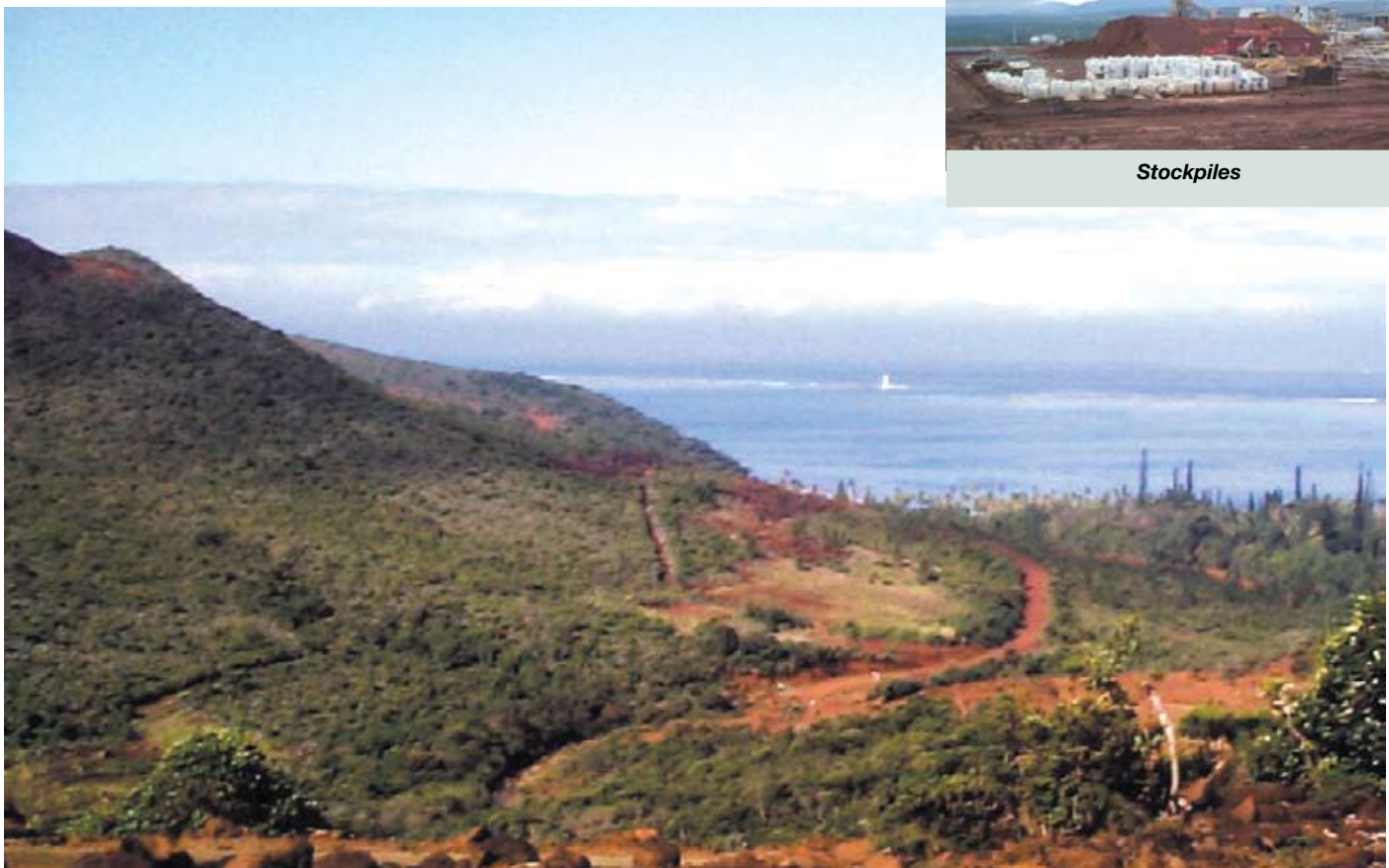
Views from the INCO pilot plant