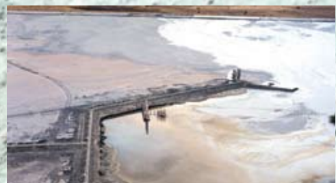
supernatant pool within poolwall confines

Inspections, monitoring and dam safety observations are conducted through daily routine inspections and observations during dam operations, monthly inspections and meetings where all areas of concern are tabled and attended to timeously. Also important are quarterly inspections and formal meetings attended by mine management, representation from the tailings dam operators and personnel from the mine's appointed professional engineer.