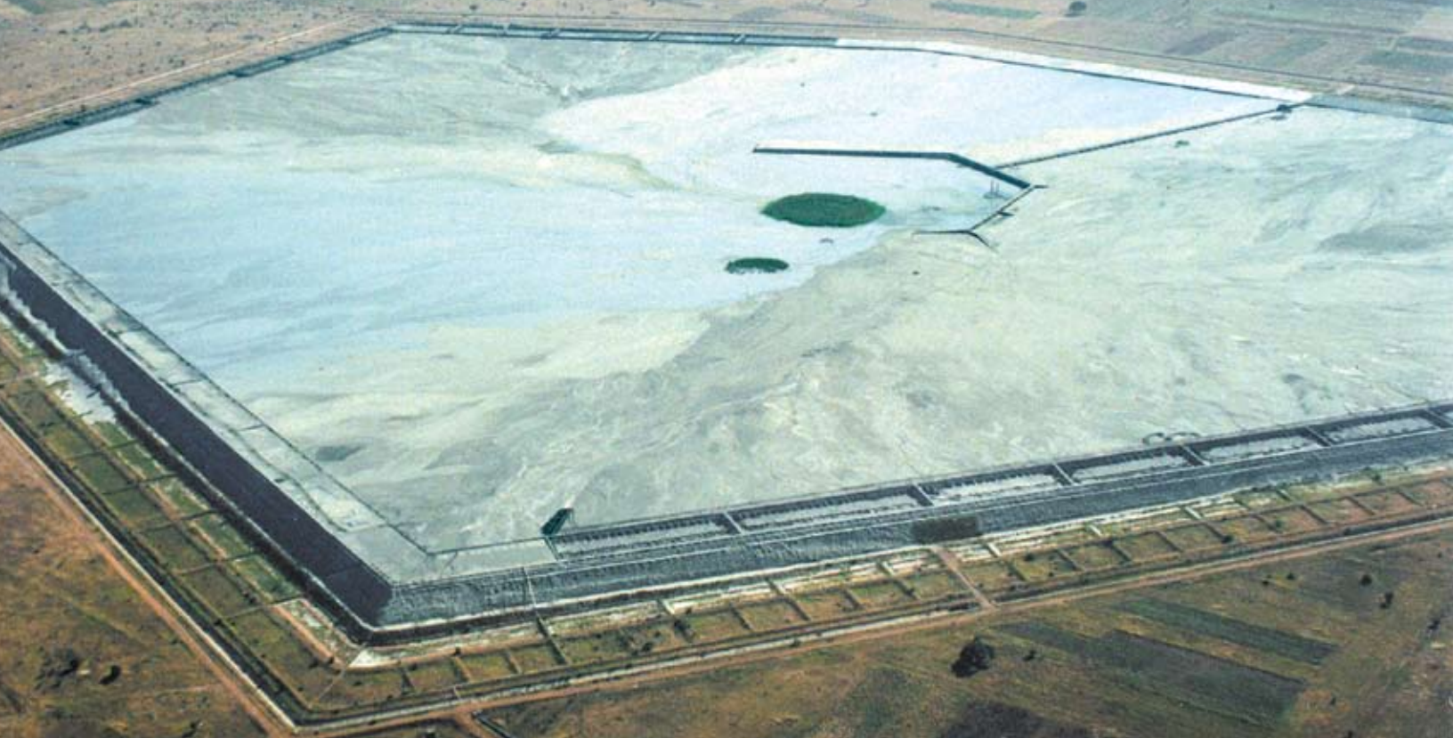
Typical platinum tailings dam

A major client in the platinum industry intends to increase production at one of its mines at the earliest opportunity. SRK was appointed to determine the maximum allowable rate of rise on the tailings dam.