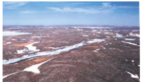
Northeast view over project area