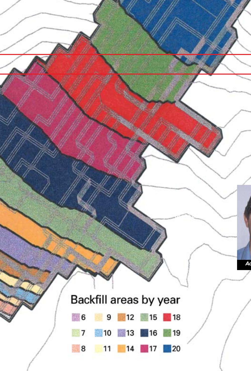
Corridor Sands Tailings Storage Facility

To obtain a copy of Adriaan's paper, "Dry Tailings Disposal – Increased Production & Potential Water Savings", contact him at ameintjes@srk.co.za .