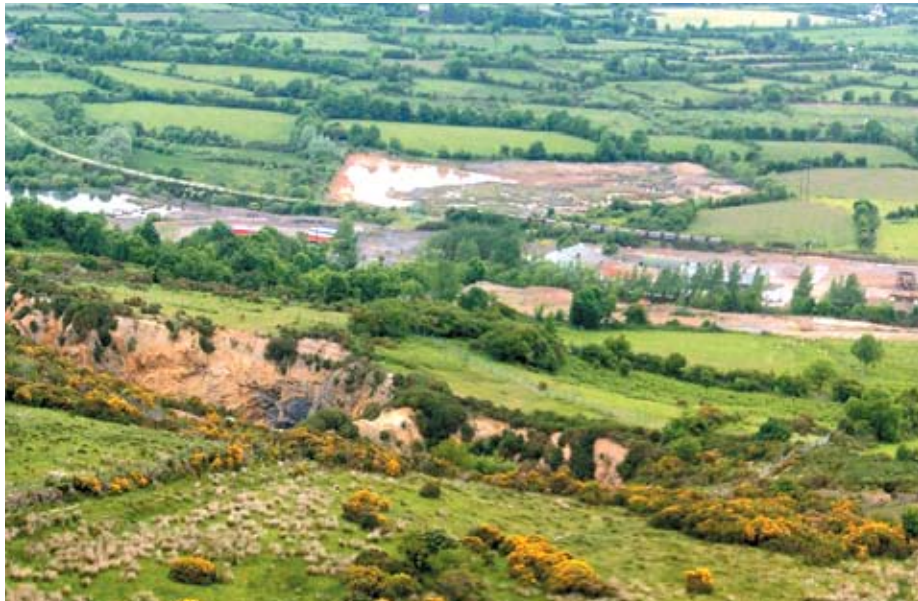
View past mining subsidence to abandoned plant structures and tailings lagoon

S nuggled against the Silvermines Mountain in County Tipperary is laid out a row of abandoned mines like a theme park on the history of mining in Ireland. The area has been exploited for over a thousand years for lead, silver, zinc, copper, barytes and sulphur. The mining remains range from shallow open-pits from the Middle Ages, through nineteenth century beam engine houses and furnaces, to extensive underground lead-zinc workings from the mid-twentieth century, finally ending with a large open-pit for baryte which closed in 1992.