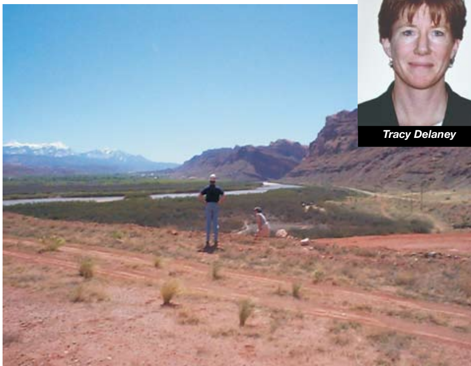
The Atlas Uranium Mill site