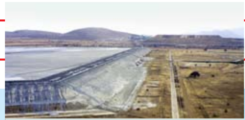
slope angles & other aspects are monitored