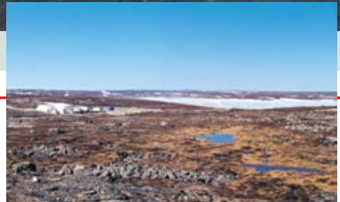
Jericho pit area

Commercial diamond production may commence as early as 2003, and the life of mine is approximately eight years.