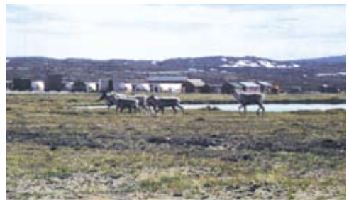
Caribou near the camp