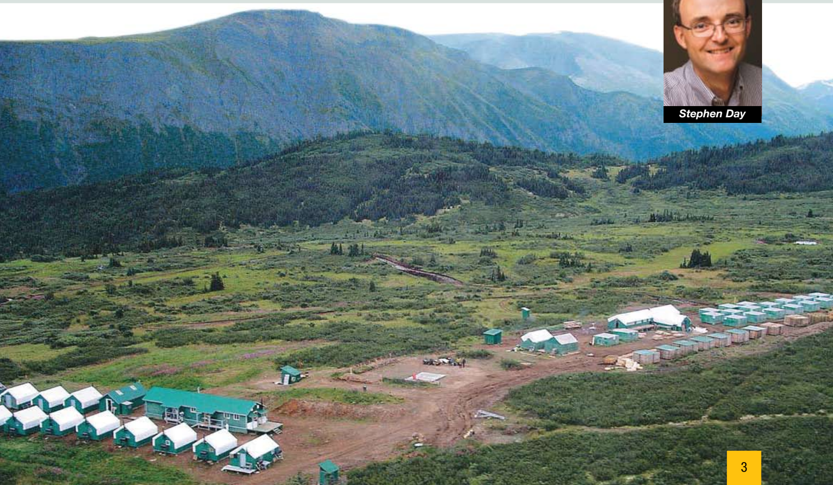
bcMetals' Red Chris porphyry copper mine