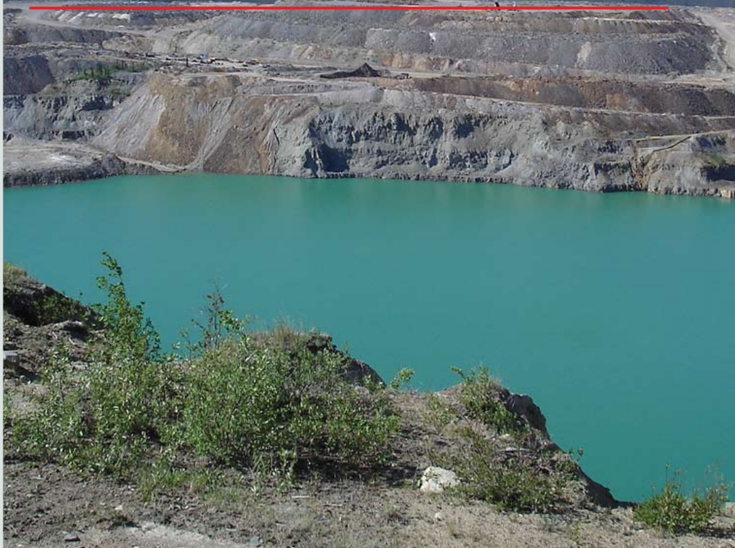
Faro Mine, Yukon Territory

L ong-term water quality predictions are essential for innovative closure planning at mine sites. From years of experience, SRK has found that data from seepage monitoring programs can be a reliable indication of water quality when combined with careful characterisation of the wastes.