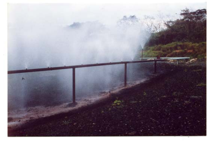
Figure 4: heat dissipation from hot groundwater