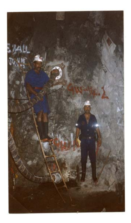
Figure 3: Underground hydraulic testing.