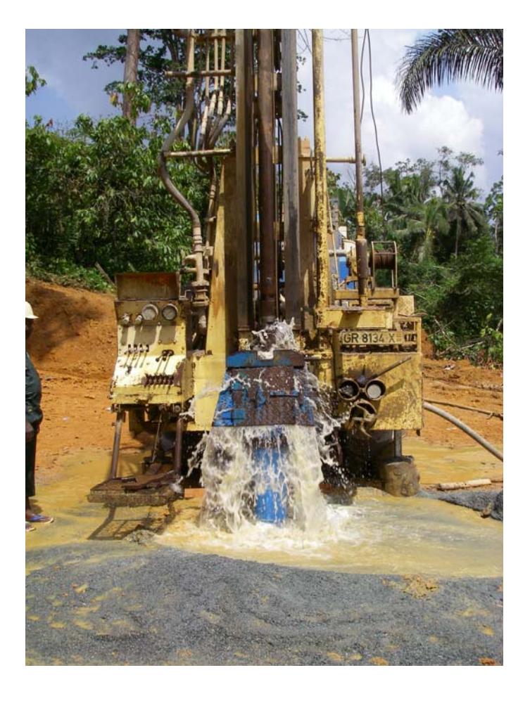
Figure 2: Unexpected high groundwater flows from Basement rocks in Africa

In a recent study in Africa a proposed mine was based on a water supply from surface water. At the level of full feasibility study it was strongly recommended to look at the potential pit inflows from adjacent alluvial sediments in the river valley. The profile was the typical African sequence of saprolite underlain by partially weathered and fractured bedrock, overlying low permeability rock, in which the partially weathered horizon of a few metres thickness is usually water bearing to some degree and provides much of the groundwater for village wells. Five boreholes were drilled for a combination of piezometer installation and test pumping. It was identified that the main aquifer was the underlying fractured bedrock so far drilled and tested to depths of around 100m and all holes with consistently very high yields (Figure 1). Earlier investigation or data collection at exploration stage would have identified potential problems for pit drainage but also identify a plentiful water supply.