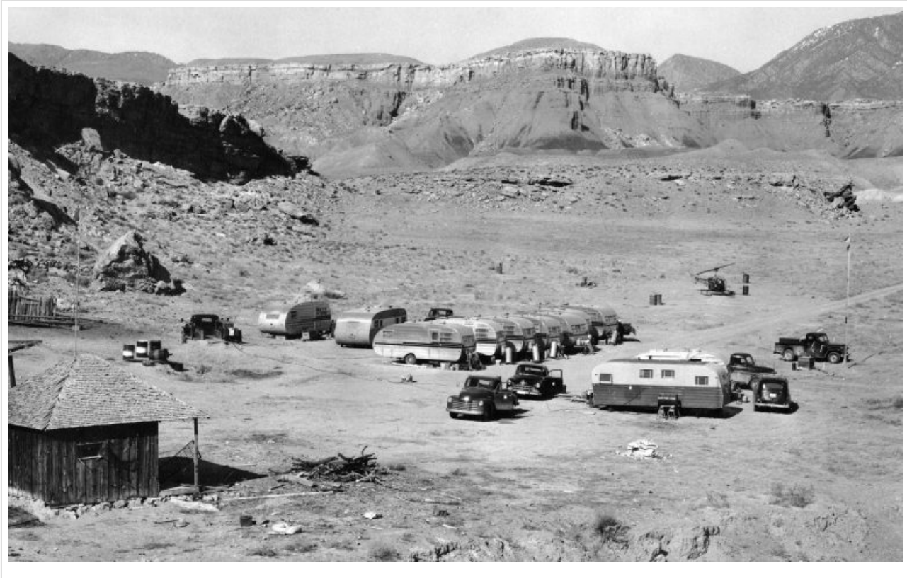
US Geological Survey 1950s field camp.

During the post-war years, especially in the Anglosphere (US, Canada, Australia and South Africa specifically), economies were strengthening, commodity prices were high due to industrial demand, mining was profitable and jobs were available for returning servicemen. Men returning from war flooded universities, and geology departments were training students in classical field methods.