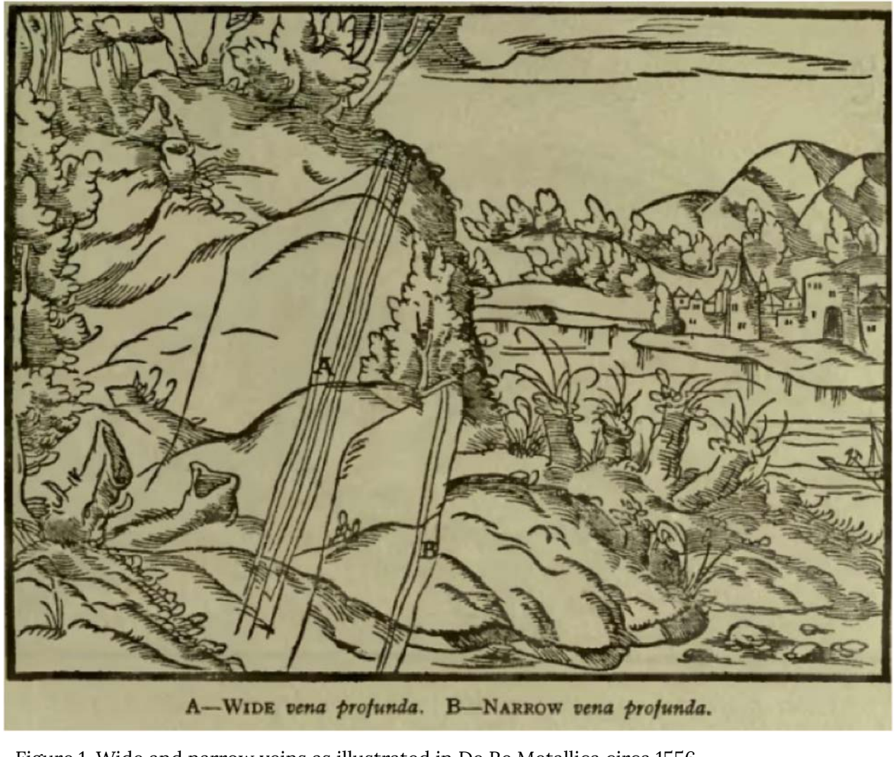
Figure 1. Wide and narrow veins as illustrated in De Re Metallica circa 1556.

Beginning in the late 18th century, new universities were being established around the globe that focused on providing engineers and geologists to support the mining and petroleum industries. These specialist schools were born out of the need to understand the Earth and train young men (as was the case at the time) to work in the mines. Some of the first mining universities included St Petersburg School of Mines in 1773, the Royal School of Mines (Imperial College London) in 1851, the Colorado School of Mines in 1874 and the University of Witwatersrand in 1896 (random fact: the world's first 'school of mines' was established in 1716 in Joachimstal, Czech Republic).